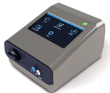
AccuFIT 9000® PRO